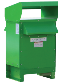
75kVA E-Saver-SOL shown with outdoor secure enclosure including solar shield option

OPAL SOL designs are designed to handle the daily cyclical full load mode of operation without requiring derating or oversizing. This means that the OPAL SOL model is sized to match the inverter's power rating – it's that simple. This saves capital cost by enabling a right-sized electrical infrastructure including breakers, conductors, conduits, space, installation, and minimizes end-to-end carbon footprint. This also improves breaker trip coordination and reduces arc flash energy.